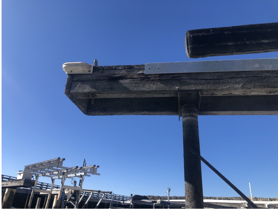
Checked & splitting dock arms