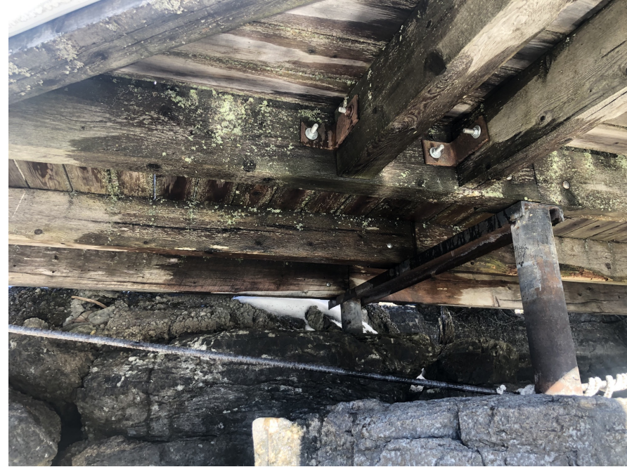
Decaying walkway structure